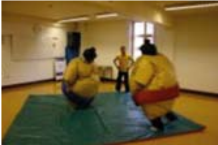
People in picture: